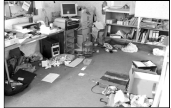
Photos of the damage done to the StayUpright building and area and items within.