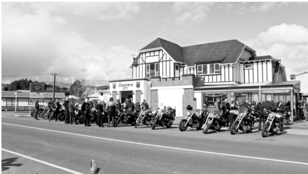
Photo of the bikes and riders from last years event

Apologies to those who were confused regarding the February meeting, however the information regarding the venue was not available to us before we went to print.